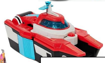
Small world play