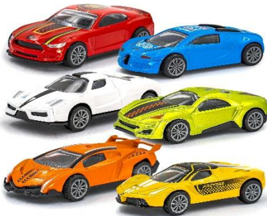
Toy cars and vehicles