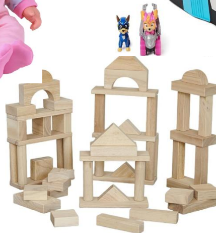
Wooden building blocks