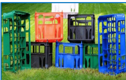
Bottle / milk crates